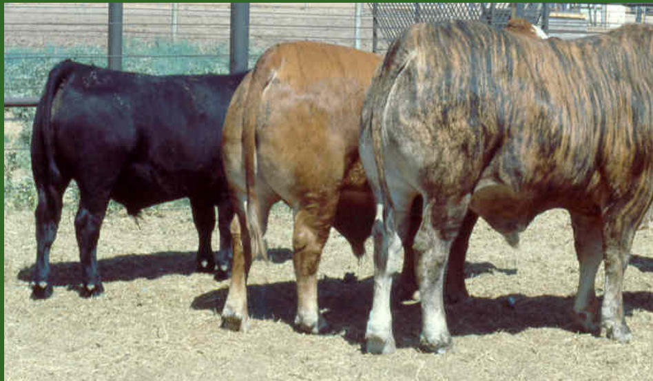
Stephen P. Hammack and Ronald J. Gill*

B ody size is an important genetic factor in beef cattle production. Historically, size was first estimated by measurements such as height or length. As scales were developed, weight became more common as a measure of size. Although measurement and weight are related, their rates of maturity differ. By 7 months of age, cattle reach about 80 percent of mature height but only 35 to 45 percent of mature weight. At 12 months, about 90 percent of mature height is reached, compared with only 50 to 60 percent of mature weight.