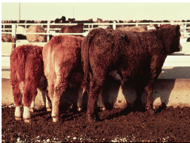
Figure 3. Frame Size can differ among cattle of the same age.

The U. S. Department of Agriculture–Agriculture Marketing Service Standards for Grades of Feeder Cattle include evaluation of frame (skeletal) size, body thickness, and thriftiness (evidence of health). A depiction of Frame Size by the USDA is shown in Figure 3. Frame Size relates to projected weight after finishing to carcass fat cover at the